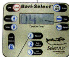
Large LCD Digital display with backlit keys